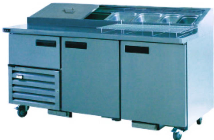
MODEL UBP1800 SHOWN - UBP2400 HAS 1 EXTRA FULL DOOR